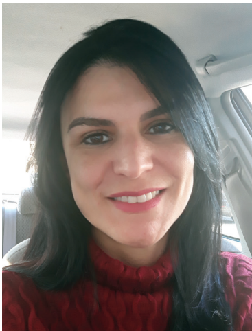
ESL Student Spotlight

English for Successful Living continues to rank as one of the largest community-based adult ESL programs in Georgia, with over 350 unique students taking part in the last year. We have established new partnerships with like-minded organizations who believe in our mission and desire to offer the immigrant population in their community the opportunity to become self-sufficient and learn English through LaAmistad ESL.